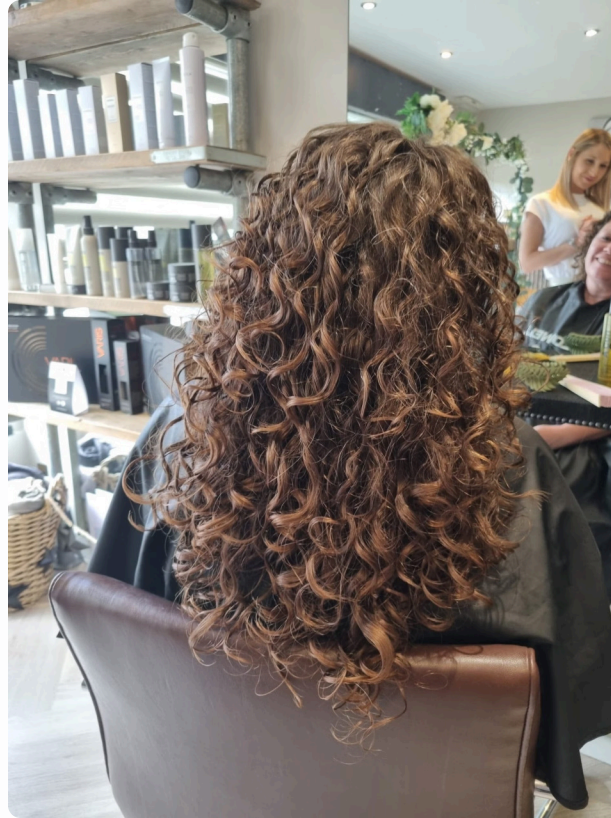
After Chloe's Cut

There wasn't much curly on Norah's hair, it was wavy but not curly.